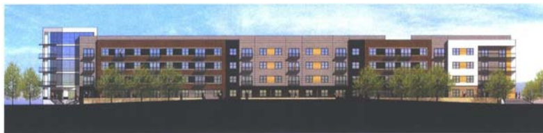
Block 1500 Project rendering

The North Central Texas Council of Governments (NCTCOG) is providing $829,789 for Hi Line Drive pedestrian improvements that will help link the District to the Victory/downtown area.