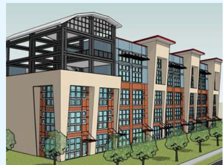
Alta Design District—1531 Inspiration Dr