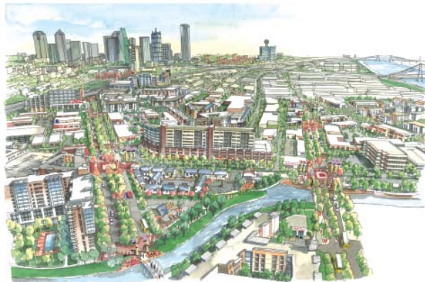
DESIGN DISTRICT DALLAS, TEXAS

The TIF program makes investing in urban areas more economically feasible by reimbursing developers for TIF-eligible expenses such as paving, streetscape, infrastructure, utility burial, open space/trails, and environmental remediation. Since inception, the City has leveraged $16 in private investment for every $1 of TIF funds pledged.