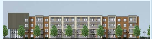
1400 Turtle Creek rendering