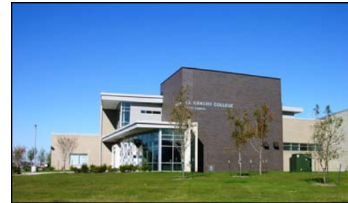
El Centro West Dallas Campus