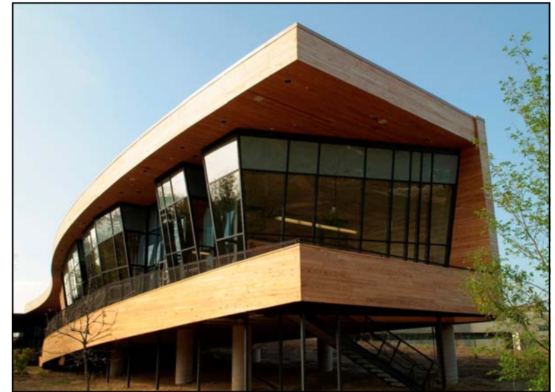
The new Trinity Audubon Center is a LEED Certified environmental education facility.