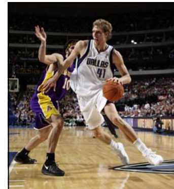
Dallas Mavericks Basketball