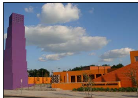
Latino Cultural Center

The cultural arts community stands as a byproduct of the economic success in Dallas. Most recently, more than 100 private donors contributed $1 M or more to support the AT&T Performing Arts Center.