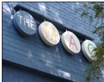
McKinney Avenue Contemporary