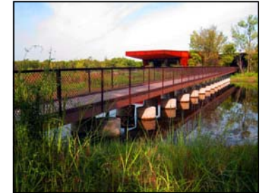
Trinity River Audubon Center