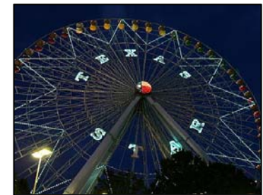
State Fair of Texas, Fair Park