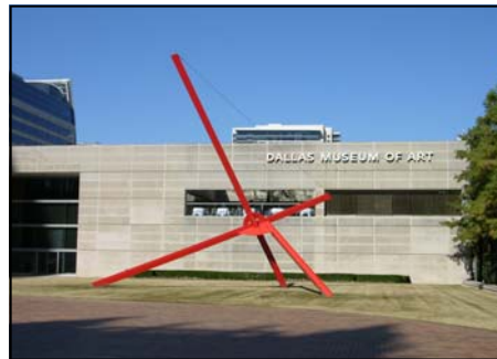
Dallas Museum of Art