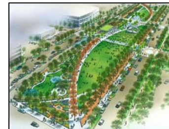
Woodall Rodgers Deck Park Rendering