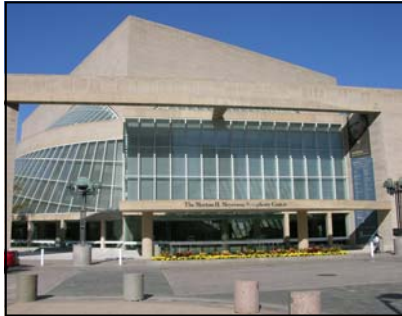
Meyerson Symphony Center