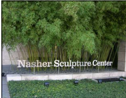
Nasher Sculpture Center