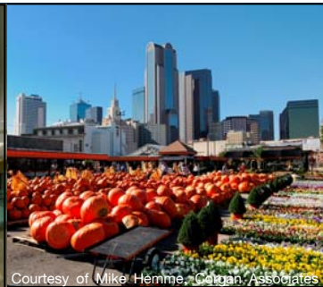
Dallas Farmers Market