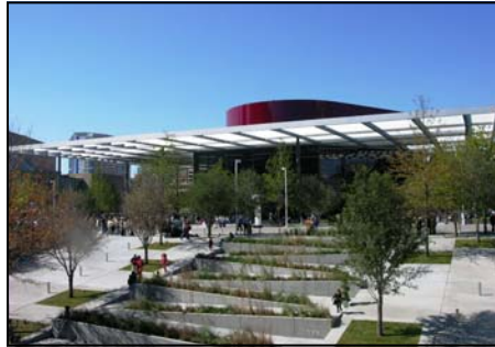
Winspear Opera House