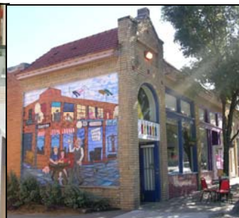
Bishop Arts District