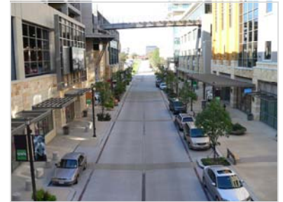
The Shops at Park Lane

porary pop-up store opened in December and the permanent store will open in fall 2011.