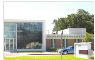
Diabetes Health & Wellness Institute at Juanita Craft Recreation Center