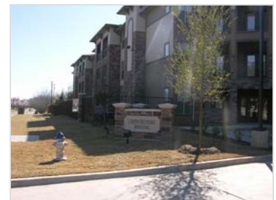
Carpenter's Point Senior Living