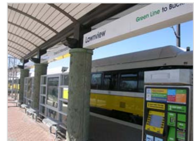
Lawnview DART Station