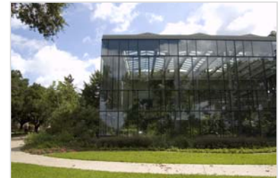
Texas Discovery Garden at Dallas Fair Park