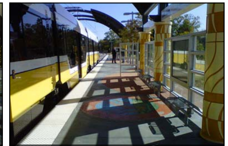
New Green Line DART Station