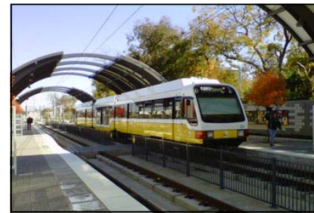
DART Light Rail Station

The recent extension of the Green Line was the largest light rail construction project in the U.S. The expansion opened December 2010, making DART the second largest light rail network in the U.S.