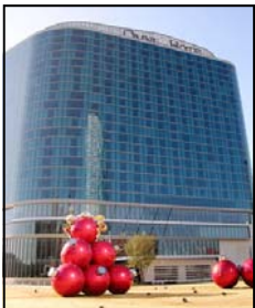
Omni Dallas Hotel

First Baptist Dallas ($115 million investment) - First Baptist Dallas is building a new worship center, fountain plaza and an education building. The campus expansion is thought to be the most expensive Protestant church renovation ever. Construction is expected to be complete in time for Easter in 2013.