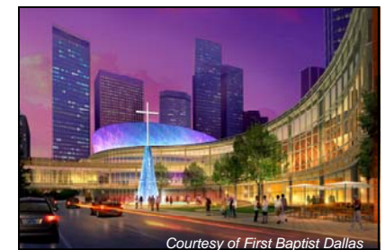
Rendering of First Baptist Dallas