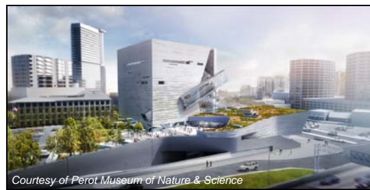
Rendering of Perot Museum of Nature & Science