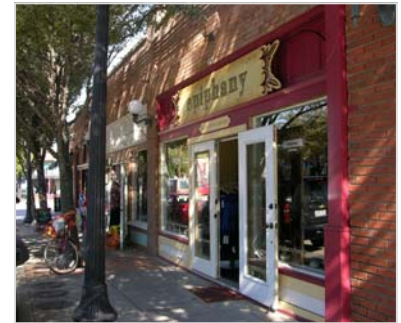
Bishop Arts District