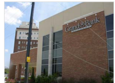
Lake Cliff Tower & Grand Bank

Source: Enterprise GIS, City of Dallas (base data from Dallas, Denton, and Collin County Appraisal Districts)