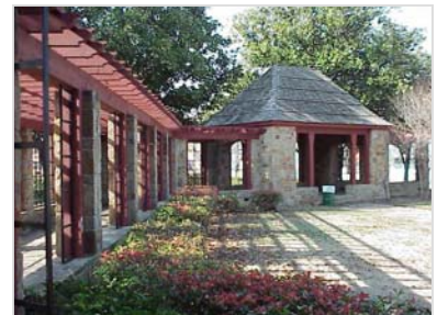
Lake Cliff Park